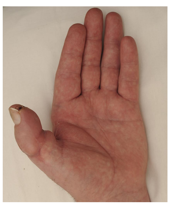
Fig 3 The hand at eight weeks after replantation. The Kirshner wire was removed after four weeks